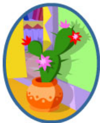
El Cacto / Cactus