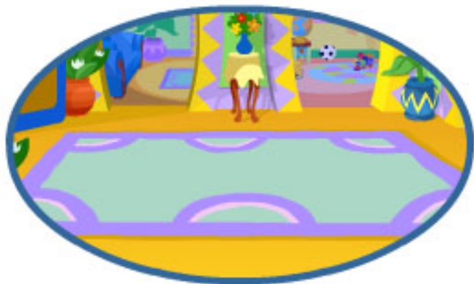
La Manta / Rug