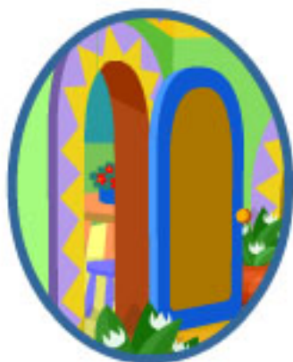
La Puerta / Door